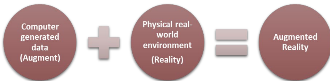
Figure (1) What's AR?